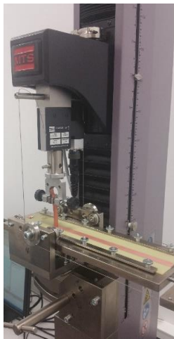
Fig. 2: Experimental peeling device. The film is pulled at constant velocity.