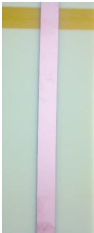
Fig. 1: Sample used for the peel test. The copper film has the following dimensions: 200mm length and 10mm width.