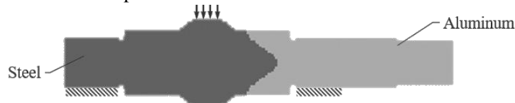
Figure 3: Optimized result for the hybrid shaft under bending with IZEO and manufacturing constraints.

For the optimization process, the objective is to have a light component, meaning the most use of aluminium and a restricted safety factor. Since this shaft has a fixed geometry, this geometry is here our design domain and the initial point of the evolution for the aluminium is the extreme side where the aluminium is intended to be in the serial manufacture. The result of the optimization process is presented in Figure 3, where the load conditions of the simulation is also represented.