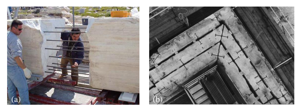
Figure 1: (a) In-situ restoration of one of the longest epistyles of the Acropolis Propylaea using threaded titanium bars; (b) Inter-connecting epistyles of the Parthenon Temple using "I"-shaped titanium beams.

The restoration technique described above generates a three-material-complex (marble-cement-titanium) with two "hidden" interfaces (i.e., marble-to-cement and cement-to-titanium). Given that damage mechanisms are firstly activated along these interfaces, any attempt to model the mechanical response of the restored elements necessitates data from these interfaces. Such data can be only obtained with the aid of novel sensing techniques,